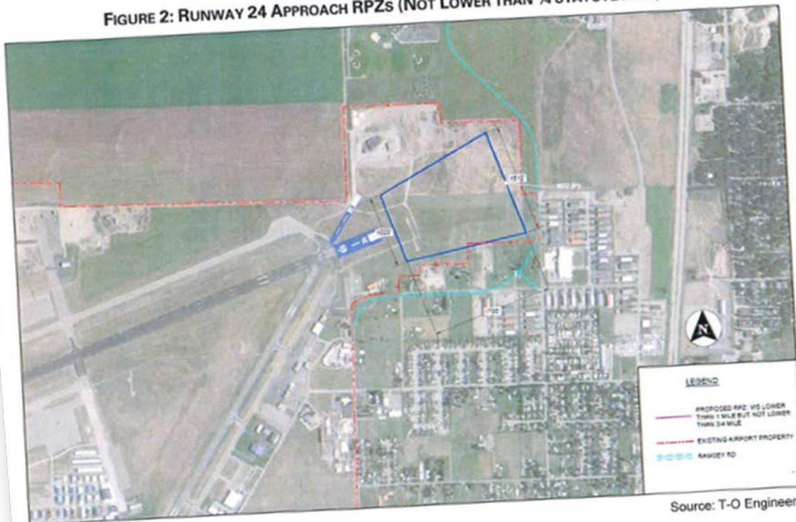
FIGURE 2: RUNWAY 24 APPROACH RPZS (NOT LOWER THAN ¼ STATUTE MILE)

Figure 2 below depicts the recommended future Runway 24 RPZ configuration. Dimensions of the recommend RPZ are as follows: length of 1,700 feet long, an inner width of 1,000 feet, an outer width of 1,510 feet and a total area of 48.978 acres.